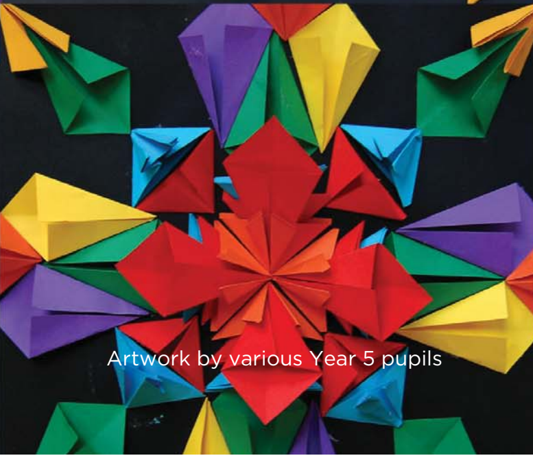
Artwork by various Year 5 pupils